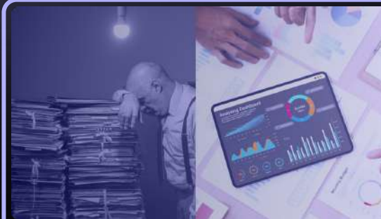
Digital Nation, Connectivity & AI as a democratizing and inclusive force