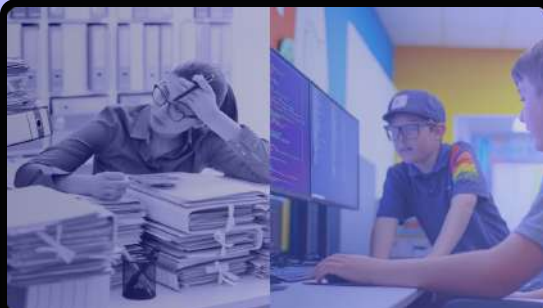
Future Skills & Talent Platforms