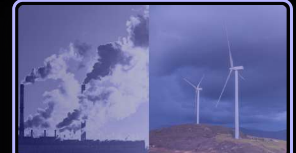
Green Energy Transition