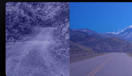
Regionalization & Inclusive Development