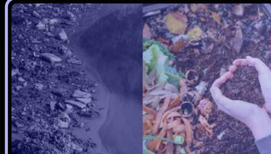
Circular Economy & Resource Efficiency