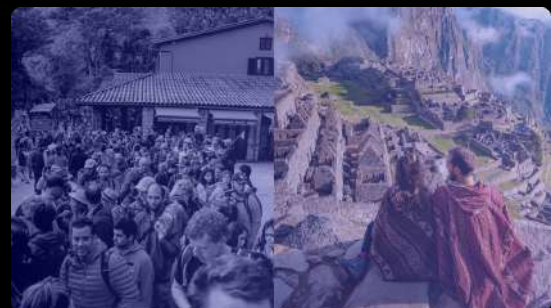
Sustainable Tourism & Experience Economy