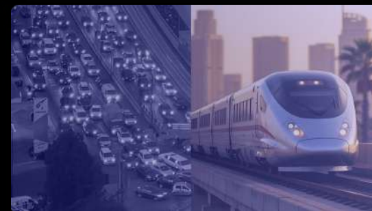
Urban Mobility & Smart Cities