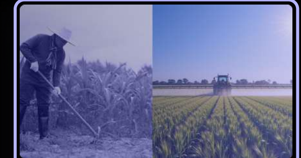
Next generation agribusiness & food systems