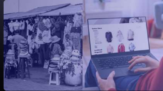
Creative Industries & Cultural Exports